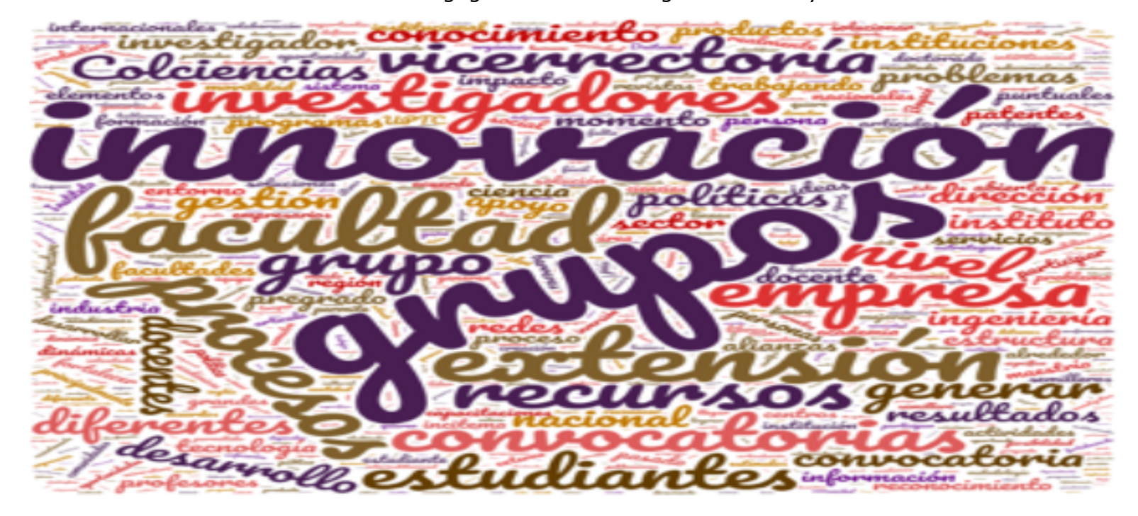
Figure 3 Word cloud at the Pedagogical and Technological University of Colombia