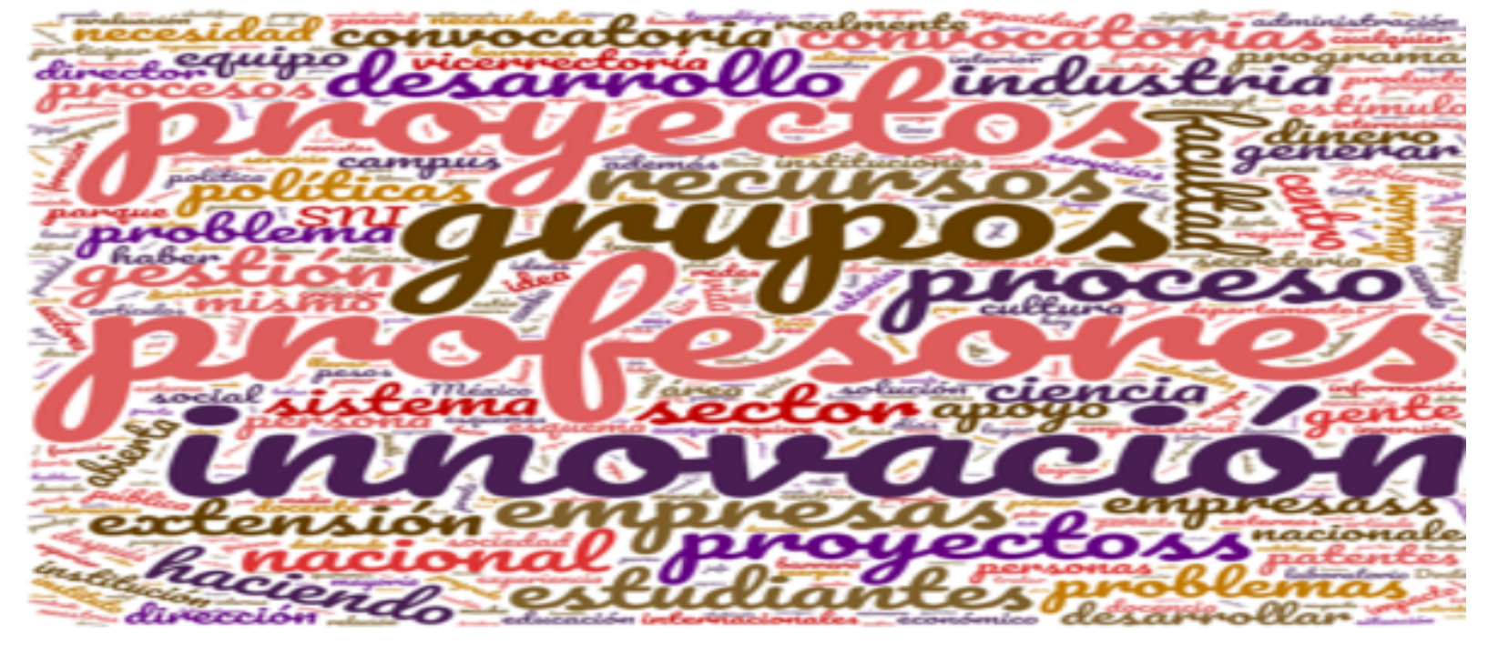
Figure 4 Word cloud at Latin American public university